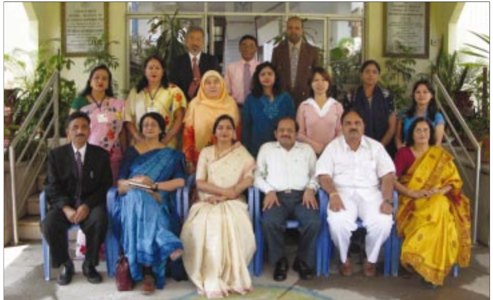
Delegates at the Networking programme posed for a photo

The programme was divided into 3 parts. On the first day, there was the inaugural session and classroom interaction combined with information on best practices in the participants' own countries. A study visit to Lijjat Papad factory was organized on the second day. Though this factory is not registered under the Co-operative Act, the organizing is functioning on co-operative pattern – collective effect