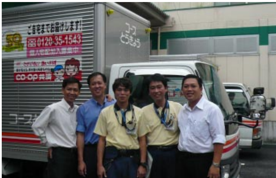
The trainee managers at the Han group delivery point of Coop Tokyo.

of each training program was about two weeks. Participants were selected after having met the requirements of the interview conducted by the ICA-AP secretary to the Consumer Committee. After arriving in Japan, trainees were given orientation at JCCU in Tokyo for four days before proceeding to the training centers for the actual program.