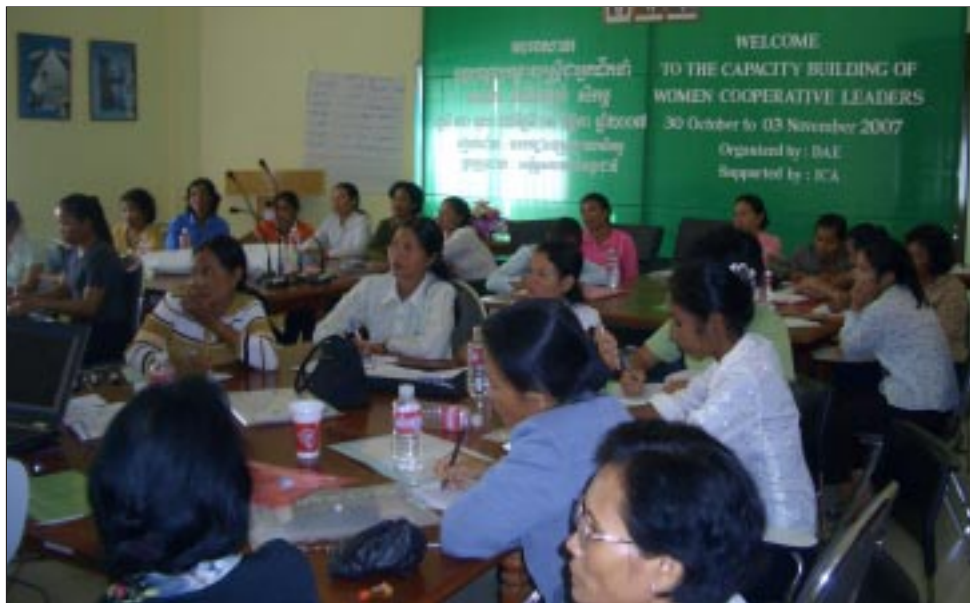
Delegates of the training program at work

In the last part of the training, the participants visited to the Barkong Angkor agricultural cooperative in Siem Reab Province. A half day interactive session was held where the chairperson, directors and other members of the co-opera-