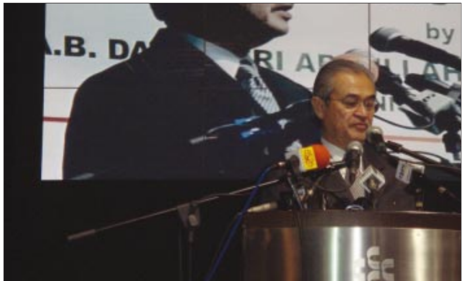
Mr. Abdullah Badawi, Prime Minister of Malaysia, speaking at the Ministers’ Conference

Although inclusive growth was seen as panacea for all economic evils, but the possible ways of integrating it within the system were seen like an unrealizable dream if cooperatives were not allowed to perform and position in the social economy. The need to clearly demonstrate the cooperative advantages by quoting real examples was projected high so as to bring up a list of indicators to benchmark its effectiveness. The Conference deliberated on the following merits of demand driven global economy