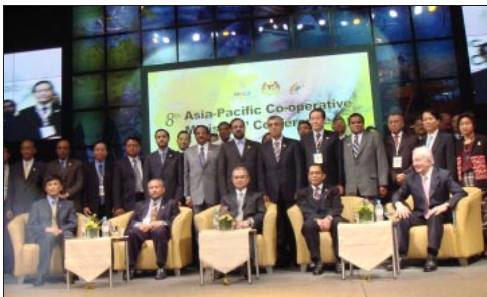
Delegates at a group photo in Kuala Lumpur

The consultation process conceived the idea of Co-operative Ministers' Conference first held in Sydney from 8 to 11 February 1990 on "Co-operative Government Collaborative Strategies for the Development of Co-operatives during