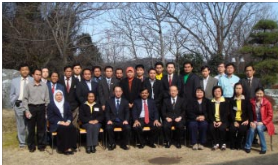
Participants of the training project for Capacity Building for Marketing at IDACA.

During the study visits programme to agricultural cooperatives in Shizuoka Prefecture the participants interacted with farmer leaders and to observe their various activities as carried out by the JAs.