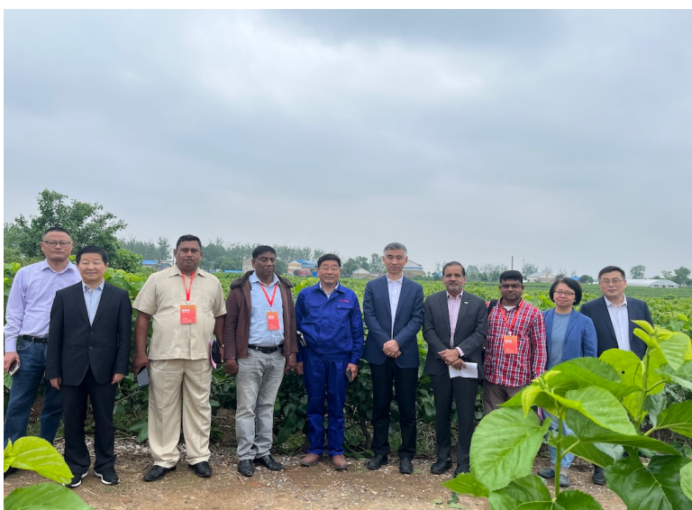
Delegation from Sri Lanka and ICA-AP with members of the cooperative and ACFMSC network