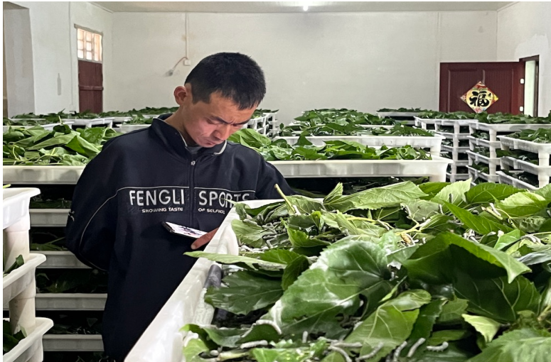
A differently abled person employed by the cooperative overseeing the silkworm center

Feixi County Golden Ox Silkworm Farmers Professional Cooperative was established in 2008. It has 358 members who are involved in silkworm production, harvesting and processing, product sales, and providing technical services. The cooperative's new and old mulberry garden covers an area of 6,300 mu, with annual cultivation of more than 7,000 silkworms and an output of 16 million yuan. It provides employment to more than 100 people and a majority are differently abled. In 2020, the cooperative built a 1016 mu silkworm science and technology demonstration park, 36 silkworm greenhouses, and 15 greenrooms. It has introduced and promoted 3 new leaf mulberry products and registered two brands, 'Xiaojingzhuang' and 'Golden Cow Silkworm.' In 2013, it won the National Demonstration Farmers Professional Cooperative.