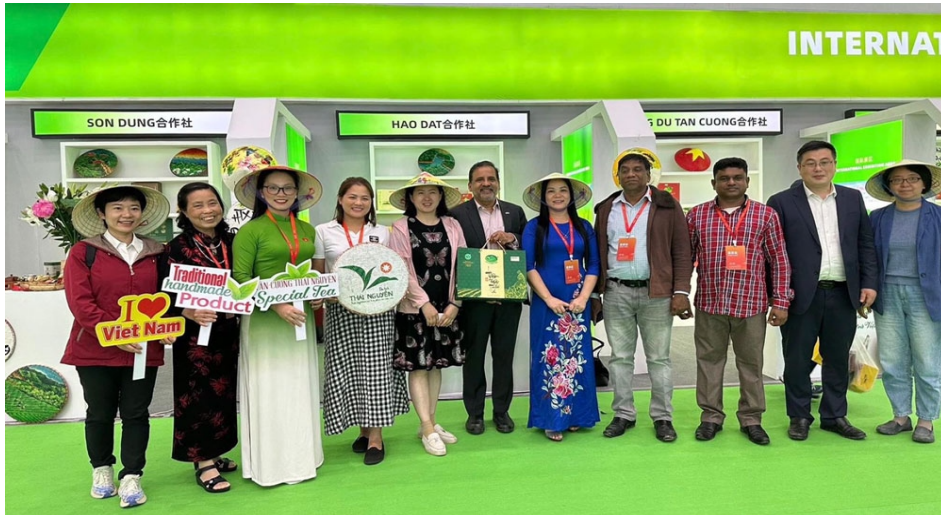
Delegates from cooperatives from China, Sri Lanka, and Vietnam

as well as understanding new technologies. Deeper connections among the cooperatives will allow them to rise up to evolving challenges and work together for a future of common prosperity. ACFSMC invited affiliates of the National Cooperative Council of Sri Lanka (NCCSL) and the Vietnam Cooperative Alliance (VCA) to the expo.