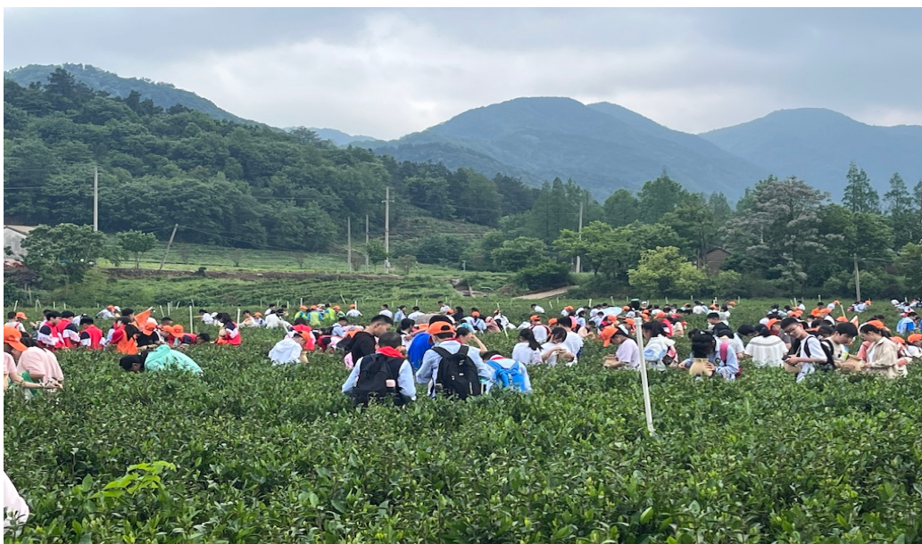
School children having hands-on experience plucking tea leaves

ABCTC also plays a role in organizing marketing activities, facilitating the tea trade, and promoting Chunhao tea both domestically and internationally. "Baiyun Chunhao" has won the titles of "Anhui Famous Trademark" and "Top Ten Famous Brands of Chinese Hui Tea." Baiyun Chunhao Tea has also been rated as "Anhui Famous Brand Products" and "Anhui Top Ten Famous Tea." It has won numerous awards which include the "Gold Award" at the 3rd China (Anhui) International Tea Industry Expo; the title of "Tea King" at the 6th China (Anhui) International Tea Industry Expo; "First Prize" at China Tea Cup Competition in 2015; "Gold Award Product" honor in the World Green Tea Appraisal; and the "Gold Award" of the China Characteristic Tourism Commodity Competition in 2020.