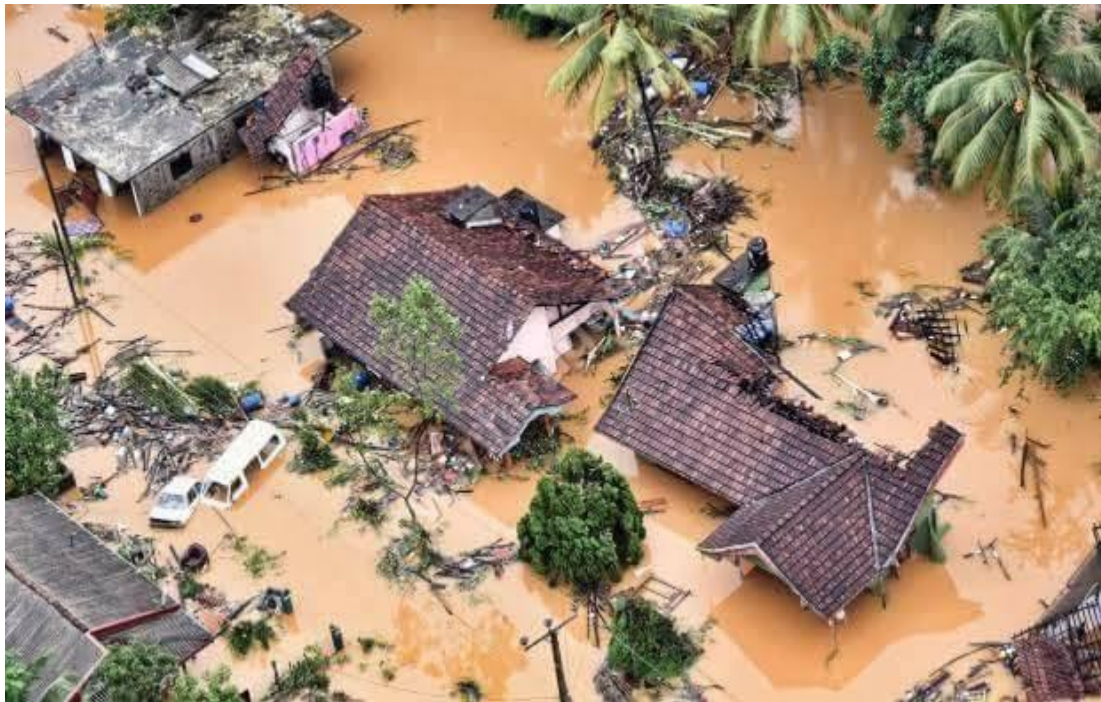
A flooded area in Kalutara, Sri Lanka, on Friday.

The beginning of the monsoon season has not bode well for Sri Lanka. The Disaster Management Center of Sri Lanka reports that 202 people were confirmed dead, more than 77,000 displaced and over 1,500 homes destroyed since floods and mudslides after the worst torrential rains since 2003. According to the Sri Lanka Consumer Cooperatives Societies Federation Limited (COOPFED), many houses, factories, co-operative outlets and belongings of people have been destroyed, and people left stranded in relief shelters. COOPFED and other ICA members in Sri Lanka have started providing relief and are planning for short and medium term support.