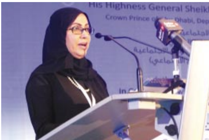
Ms. Mariam Al Roumi, Hon'ble Minister of Social Affairs, Government of UAE speaking at the Government Co-op Dialogue