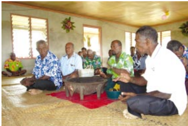
ICA Conference on Co-operative Development in South Pacific