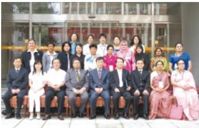
Women delegates and others pose for a group photo in Beijing

by All China Federation of Supply and Marketing co-operatives.