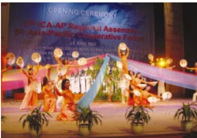
A cultural show presented at the Regional Assembly

in China in 2010 was accepted by the house.