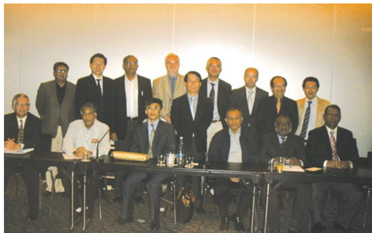
ICA-AP Board members at the special meeting of Standing Committee

The New ICA Membership subscription formula was adopted with a thumping majority at the Extraordinary General Assembly of ICA in Rome, Italy on 5th June 2008