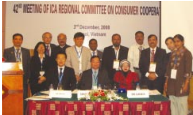
Delegates at the Consumer Committee meeting