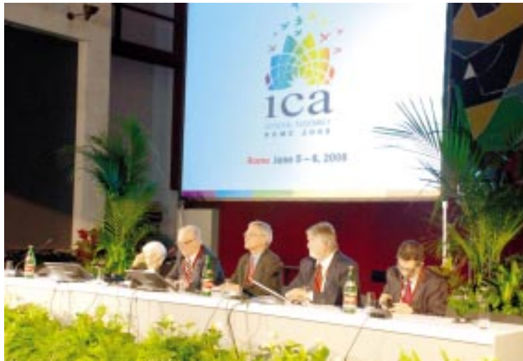
Delegates at the Extraordinary General Assembly 2008, Rome

members of the ICA Asia Pacific Standing Committee and said that the new system in long run would definitely increase the membership base of ICA and eventually make co-operatives appreciate about the merits of active user members in the development of co-operatives.