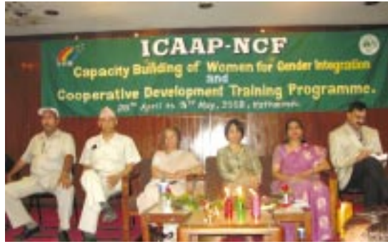
Organizers of the Training Programme in Nepal

These training workshops were organized with the objective of raising awareness of women and men leaders and members of cooperatives on gender issues, on the manifestations of gender bias (against women) in cooperatives, and on the effects of gender discrimination on the personal and interpersonal growth of its leaders and members as well as on the organizational development of cooperatives. It also aimed on building up the capacity of current and potential women leaders of cooperatives by equipping them with knowledge and skills on nature of co-operatives, effective and gender responsive leadership, co-operative enterprise management, coping with challenges and personal development.