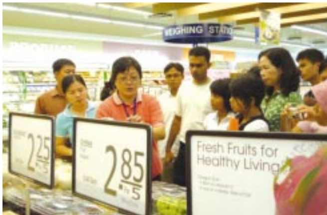
Delegates visit a FairPrice Co-op supermarket

The participants visited a hypermarket and two supermarkets of NTUC FairPrice and its competitors' stores on the second day. They learnt about practical techniques for store operation such as merchandise assortment,