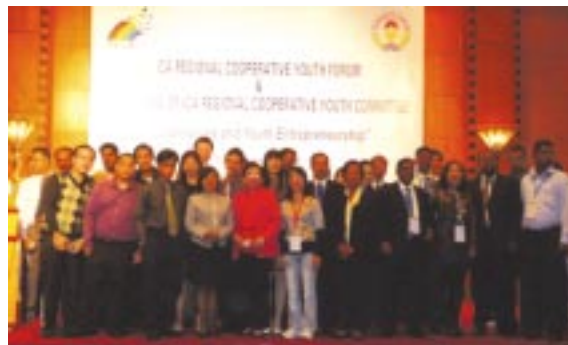
Delegates at the Regional Youth Conference