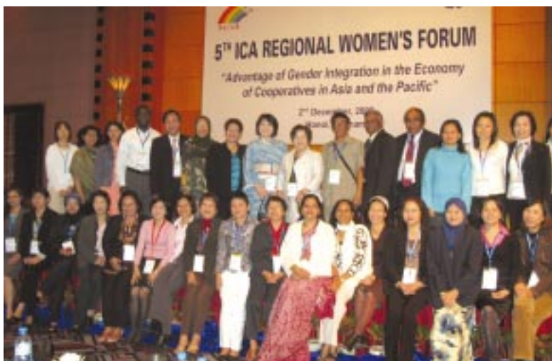
Delegates at the Regional Women's Forum