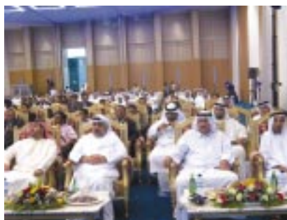
A view of the dignitaries at the inauguration of the Dialogue