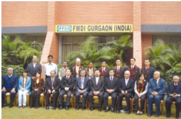
Participants of Training Course at the FMDI, Gurgaon, India