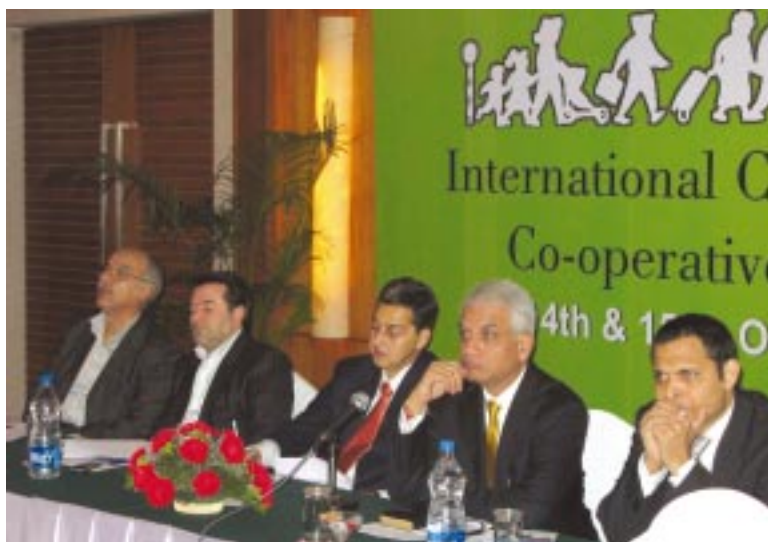
Panelists at the concluding session of the Conference

countries namely Iran, Italy, Japan, Korea, Malaysia, Maldives, Norway, Sri Lanka and UK.