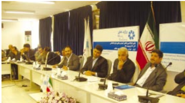
A view of the Workshop on University/College Co-operatives, Iran

The workshop was attended by almost 90 participants.