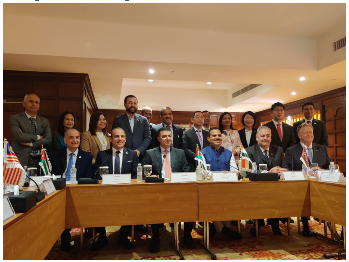
ICA-AP Regional Board Meeting Held in Jordan

The ICA-AP held its first regional board meeting of 2024 in Dead Sea, Jordan on the sidelines of the 11th Asia Pacific Cooperative Ministers' Conference (APCMC) on 27 April.