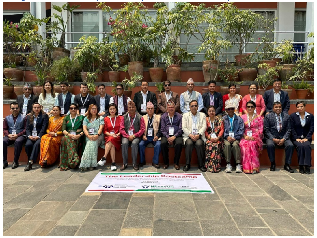
ACCU Organized Leadership Bootcamp for NEFSCUN in Nepal

The Association of Asian Confederation of Credit Unions (ACCU), a pan-Asian ICA member organized the 20th Batch of the Leadership Bootcamp, for the Nepal Federation of Savings and Credit Cooperative Unions (NEFSCUN), an ICA member in Nepal, from May 1 to 3, 2024. The Bootcamp convened 26 Board, committee, and senior staff members for an intensive training program aimed at enhancing their leadership skills and capabilities. ACCU acknowledges the pivotal role of leadership in cultivating an environment of innovation and creativity within organizations. Leaders are tasked with empowering their teams to explore unconventional ideas, experiment freely, and view failure as a stepping stone toward eventual success. By nurturing such a culture, leaders can unleash their teams' full potential and drive substantial transformations.