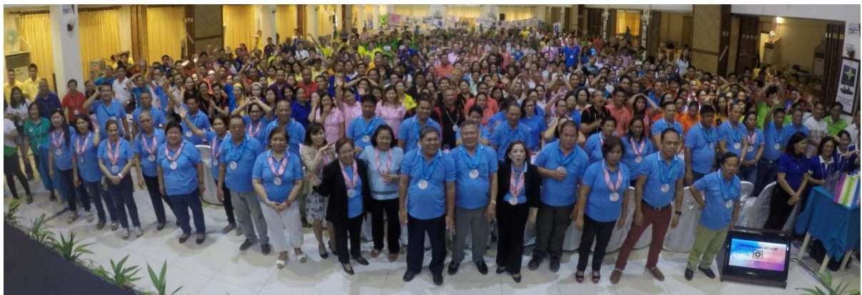
Group photograph of participants at 46 th Annual General Assembly of the VICTO

More than 650 Co-operators from 150 member co-operatives, gathered in beautiful Boracay Island, located 200 km South of Manila on 21 and 22 May. The occasion was the the 46 th Annual General Assembly of the VICTO National Co-operative Federation and Development Center (VICTO National), the apex and educational organization of co-operatives in Philippines. The theme for this year was, "Towards 2020; What will your co-op look like?"